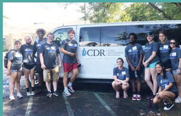
Student volunteers from Christopher Newport University

We value gifts of ALL sizes; to maximize space in this publication this listing represents $100+ gifts to CDR. A complete list can be found in the online version of our report at cdr.org/annual-report .